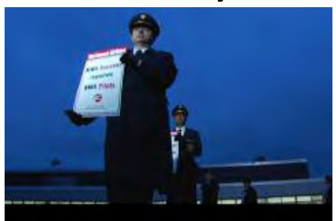
In a letter to KPFA Labor Collective: