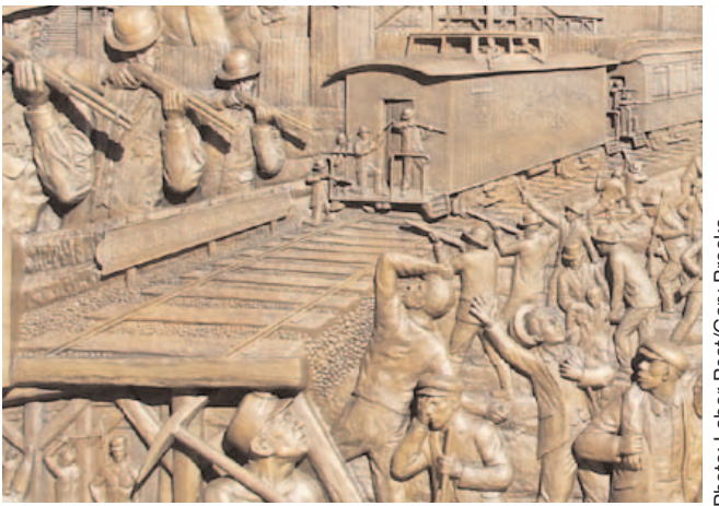
Detail of the new coal miners monument in Virden, Illinois.

Video covers the Oct. 28th dedication of the monument for the Virden massacre in 1898 in Southern Illinois, with interviews, coal miner memorabilia, a fire-breathing speech by UMWA President Cecil Roberts, plus the commemoration ceremony at the Mother Jones monument only a few miles away in Mt. Olive, Illinois. 27 min. For a dvd, indicate title and mail $15 to: Labor Beat, 37 S. Ashland Ave., Chicago, IL 60607. For more info: mail@laborbeat.org, 312-226-3330.