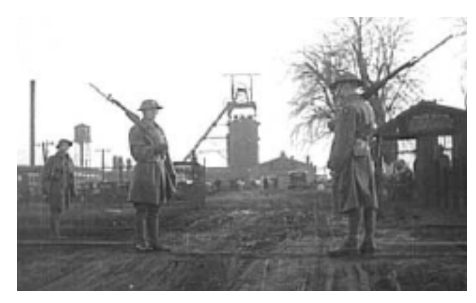
State militia posted at a Peabody mine near Kincaid, IL, 1932

Through the early 19th to mid-20th century, coal mining was the industrial engine of downstate Illinois. Workers organized under the banner of the United Mine Workers of America (UMWA) to win safe working conditions and better pay.