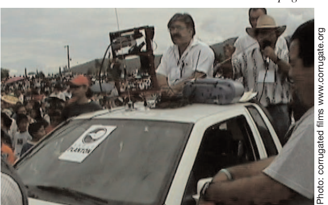
Radio Plantón covering the Oaxaca uprising

The uprising of the people of Oaxaca was centered around the heroic strike of the teachers union there, but it expanded to encompass broader social causes. In that ongoing struggle, brave cadres of media activists, from Mal de Ojo Tv (http://mexico.indymedia.org/oaxaca) to Radio Plantón (www.radioplanton.net) and others, have remained steadfast at the electronic—and street—barricades, bringing to an continued on page 2