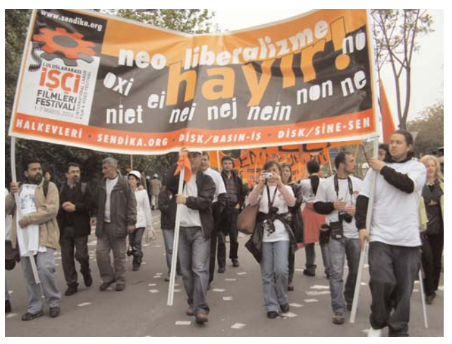
Turkey Labor Fest contingent at May Day march in Istanbul.